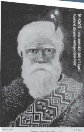
Te Kōwhiri - Māori-issatōkōs-āssāi (11 Ngāru) Auckland Libraries Heritage Collections